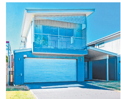
16b Long St, Cleveland, 4bed 2bath 2car, PI n/a, LJ Hooker - Cleveland, Greg Cocks