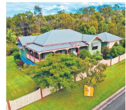
18 Grevillea St, Redland Bay, 4bed 2bath 2car, Sold Prior $710,000, LJ Hooker - Cleveland, Val Elworthy