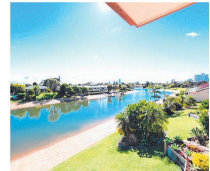
5 'Riverglen', 4-6 Dunlop Ave, Mermaid Waters, 2bed 2bath 1car, Sold $280,000, Professionals Broadbeach, Shaun Bourke