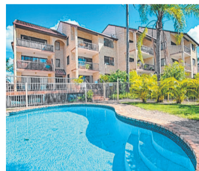
7 'Palm Trees', 16 St Kilda Ave, Broadbeach, 2bed 2bath 1car, Sold PT $375,000, Professionals Broadbeach, Shaun Bourke