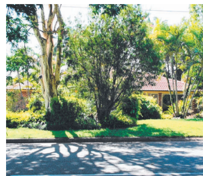
88 Princess St, Cleveland, 4bed 2bath 2car, Sold $377,000, LJ Hooker - Cleveland, Val Elworthy

LEGEND: SP (sold prior); PI (passed in); PT (private treaty); W (withdrawn); S (sold).